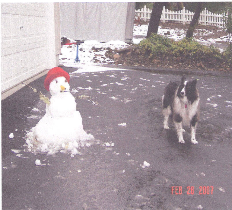
Jim the wonder dog!!!!

Hope you all enjoyed the beautiful blanket of snow we had this last week. Next meeting is March 17, See you then.