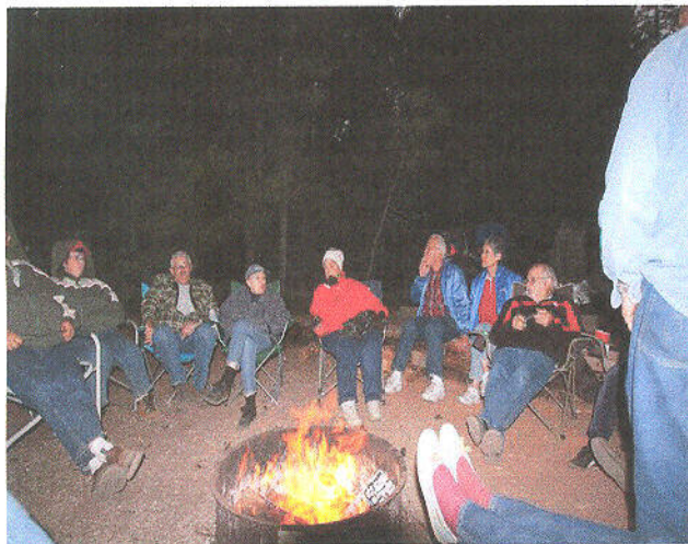
LABOR DAY CAMP OUT