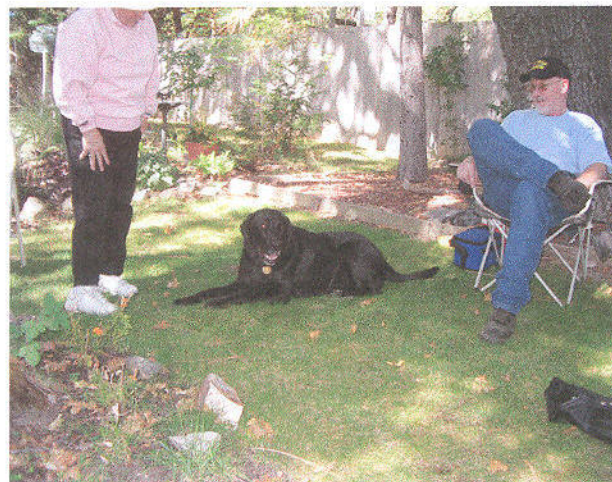
GUNNER ENJOYING THE EASY LIFE