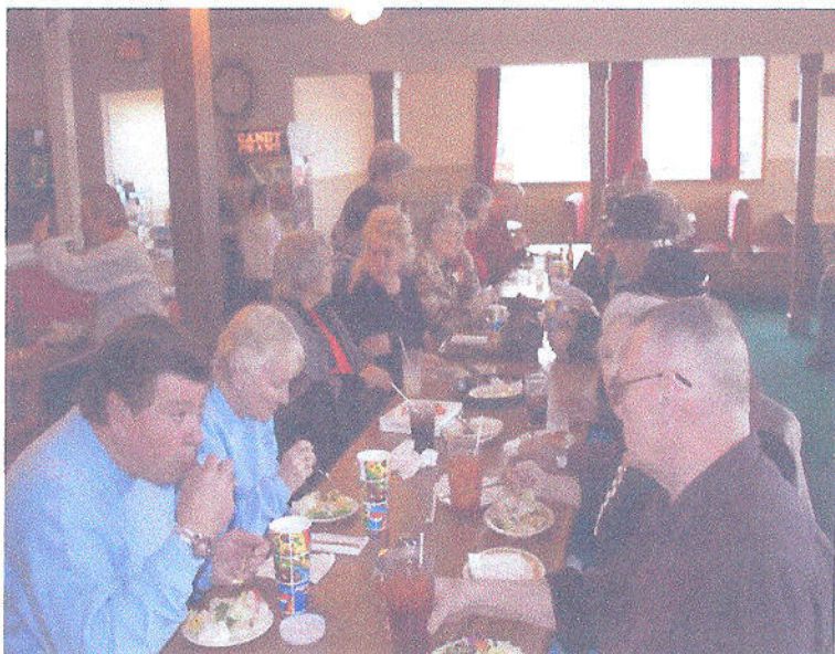
Polar Bear Lunch