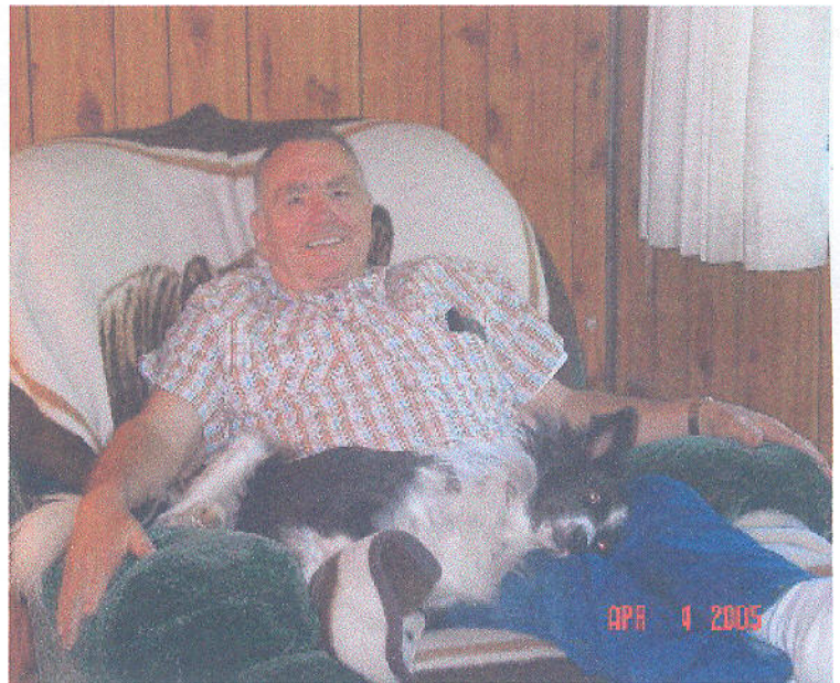
DON AND JIM

Remember, dogs are better than kids because they (1) eat less, (2) don't ask for money all the time, (3) are easier to train, (4) normally come when called, (5) never ask to drive the car, (6) don't hang out with drug-using people; (7) don't smoke or drink, (8) don't want to wear your clothes, (9) don't have to buy the latest fashions, (10) don't need a gazillion dollars for college and (11) if he gets a female friend pregnant, you can sell their children