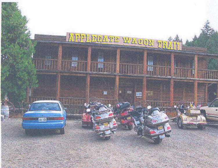
SUNNY VALLEY MUSEUM